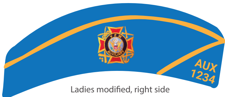
Ladies modified, right side