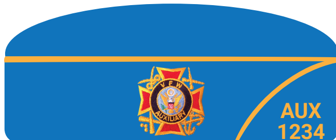
Overseas style, right side